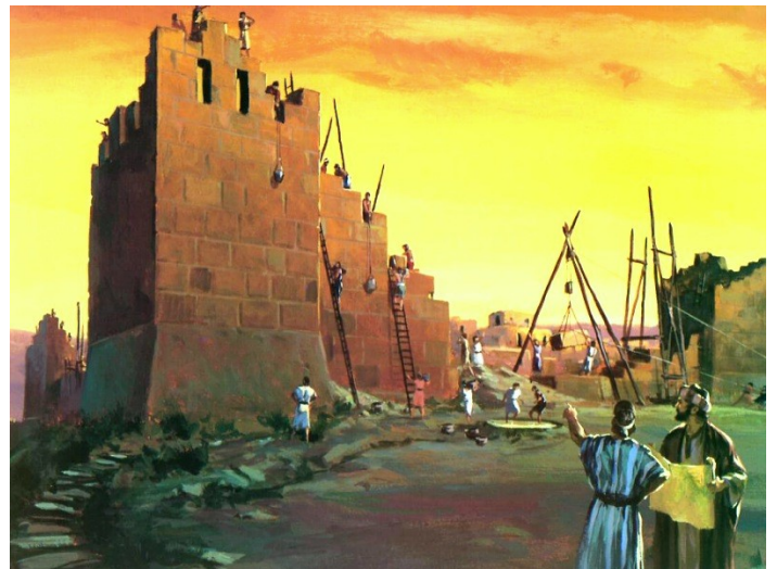
21 Life Lessons From Nehemiah

Nehemiah was given his freedom and allowed to go rebuild Jerusalem's walls. First Chronicles 16:11 says, "Seek the LORD and His strength, seek His face continually." One of the best ways to seek the Lord's guidance is to pray and listen. Prayer is important, not only because it strengthens our relationship with God, but also because it connects us spiritually with Him and the world around us. When you aren't in a committed relationship with God and don't value the importance of prayer, it's easy to get distracted by everything going on in the world around you. When prayers aren't answered the way we want them to be, the conversation easily goes from "we" to "me." But when you routinely pray, and listen to what God is saying, the focus shifts from the personal to the needs of others, and you'll better understand what God is telling you.